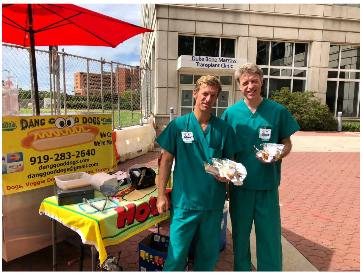
Dang good dogs for lunch at Duke Ambulatory Surgery Center.